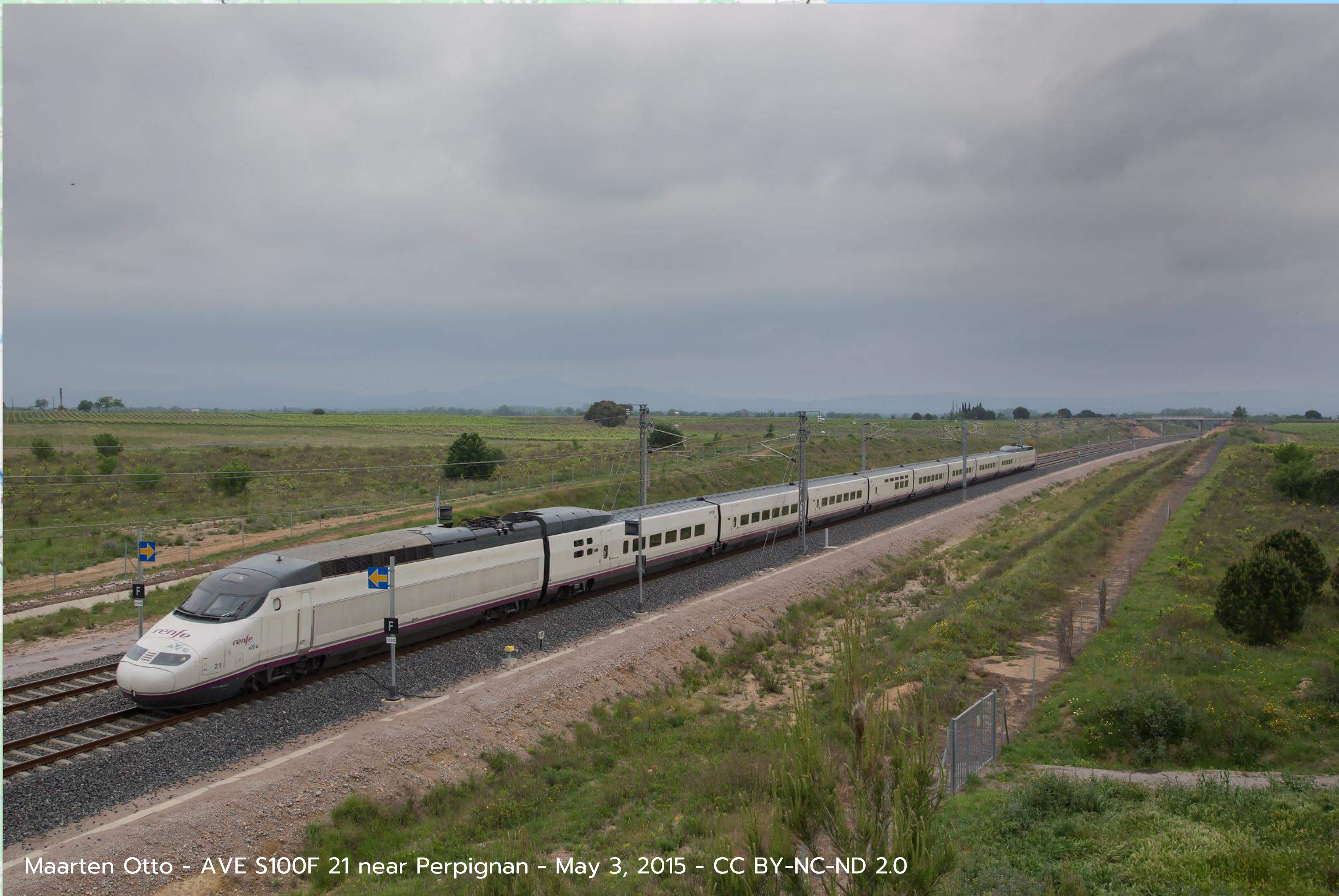
Maarten Otto - AVE S100F 21 near Perpignan - May 3, 2015 - CC BY-NC-ND 2.0